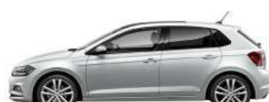
White Silver Metallic*