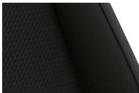
"Slash" cloth Titan Black (EL) Standard on Comfortline & R-Line