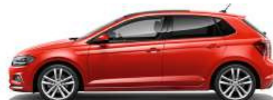
Flash Red Solid*