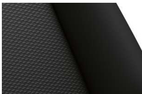
"Basket" cloth Titan Black (EL) Standard on Trendline