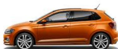
Energetic Orange Metallic*