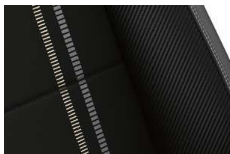
"Level" cloth Titan Black (EL) Optional on R-Line

* Optional at extra cost. Please note, the print processes do not allow exact reproduction of the upholstery colours.