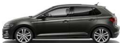
Urano Grey Solid