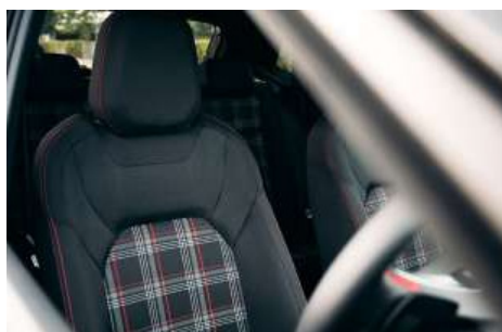
"Clark" cloth Titan Black (XE) Standard on GTI