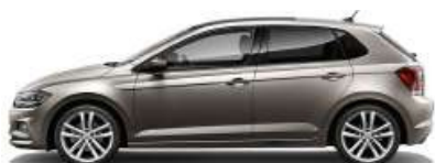
Limestone Grey Metallic*