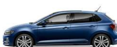
Reef Blue Metallic*