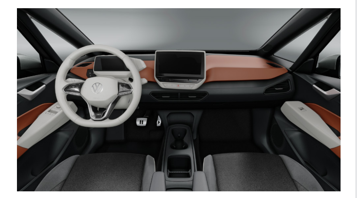
Standard from ID.3 Business