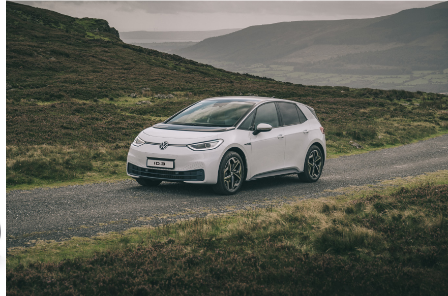
Note: The above images show optional Silver Bi-Colour Styling Package

The above specifications are for information purposes only as our products are continually updated and changes may be made to the specifications at any time. If you require any specific feature, you must consult your local dealer who is regularly updated with any change in specification. Specifications are subject to change without notice