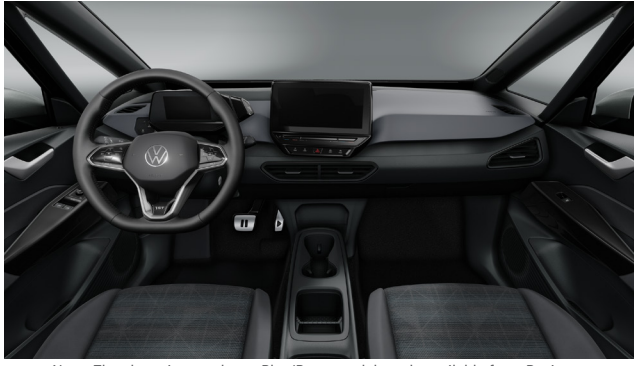
Note: The above image shows Play/Pause pedals, only available from Business Standard on ID.3 Life