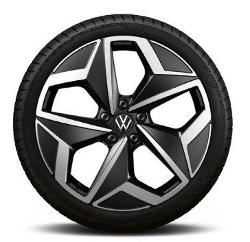
STANDARD ON ID.3 Tour 5, Tour & 1st Plus OPTIONAL ON ID.3 Family, Style, Tech & Max 19" 'Andoya' alloy wheels 7.5J x 19 Tyres: 215/50 R19