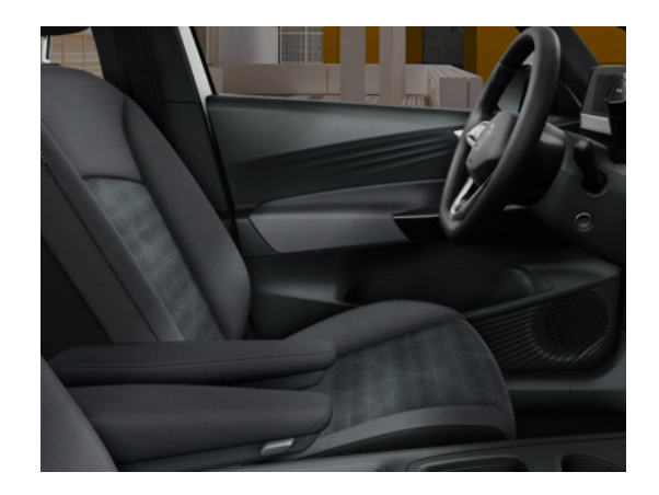
"Fragment" Cloth Platinum Grey/Soul Standard on ID.3 Life