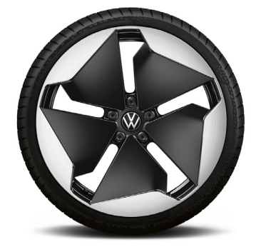
OPTIONAL ON ID.3 Family, Style, Tech, Max, Tour 20" 'Sanya' alloy wheels 7.5J x 20 Tyres: 215/45 R20