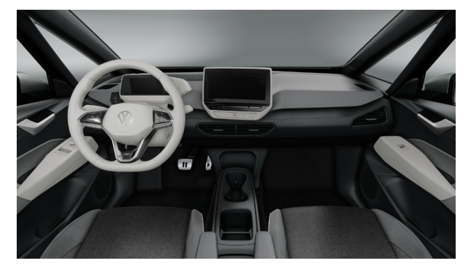
Standard from ID.3 Business