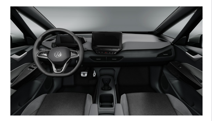
Standard from ID.3 Business Dusty Grey Dark/ Piano Black