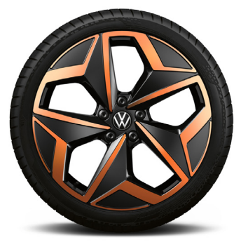
OPTIONAL ON ID.3 Family, Style, Tech, Max, Tour 5 & Tour

19" 'Andoya' alloy wheels in 'Penney Copper' 7.5J x 19 Tyres: 215/50 R19