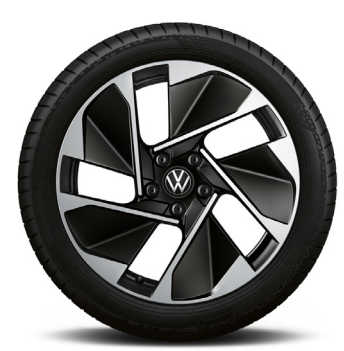
STANDARD ON ID.3 Family, Style, Tech & Max 18" 'East Derry' alloy wheels 7.5J x 18 Tyres: 215/55 R18

STANDARD ON ID.3 Life & Business 18" Steel wheels 7.5J x 18 Tyres: 215/55 R18