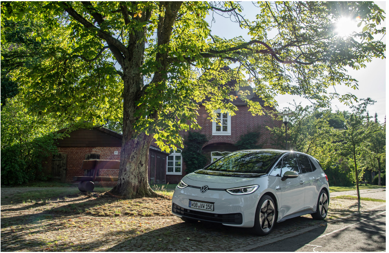
Note: The above image shows ID.3 Tour with optional 20" 'Sanya' alloy wheels and Silver Bi-Colour styling package

Private RRP: €43,290* Commercial RRP: €48,290**