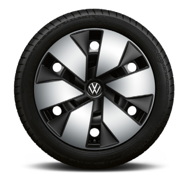
OPTIONAL ON ID.3 Life & Business 18" Steel wheels with Bi-Colour package 7.5J x 18 Tyres: 215/55 R18