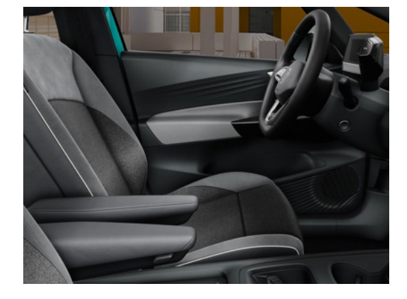
"Flow" 'ArtVelours' Microfleece Platinum Grey/Dusty Grey Dark Standard from ID.3 Business