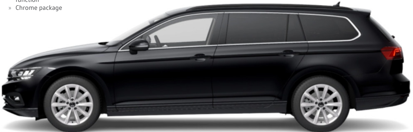
Note: The above images shows optional "Deep Black" pearl effect paint