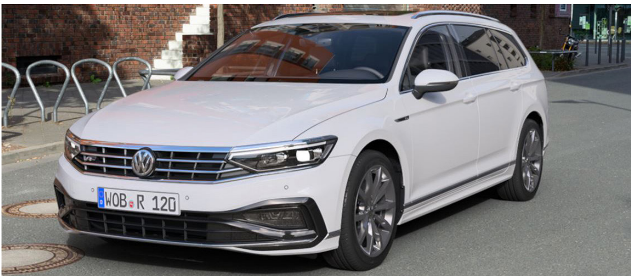
Note: The above image shows 'R-Line' Model in "Oryx White" Pearl Effect paint with optional Matrix LED package.

The above specifications are for information purposes only as our products are continually updated and changes may be made to the specifications at any time. If you require any specific feature, you must consult your local dealer who is regularly updated with any change in specification. Specifications are subject to change without notice. Effective from 25 May 2021, for production from CW48/2020 onwards. All prices include VAT and VRT. These prices are subject to change once technical data comes available.