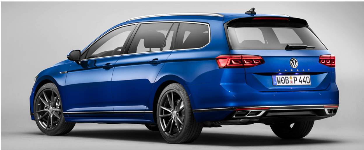
Note: The above image shows 'R-Line' Model in "Lapiz Blue" metallic paint with 'Pretoria' 19" alloy wheels in Grey Metallic and optional Matrix LED package.