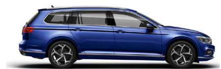
Lapiz Blue Metallic*