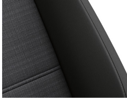
"Weave" cloth Titan Black/Blue (TO) Standard on Business models