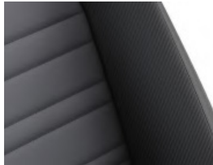
"Carbon-Flag"/Vienna (W05) Flint Grey/Titan Black (OK) Optional on R-Line