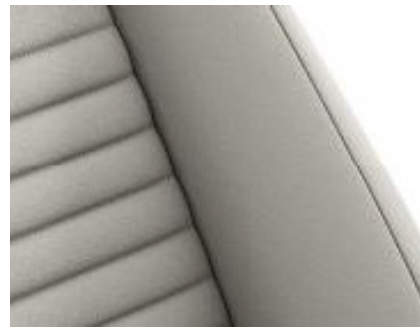
"Alcantara"/ "Vienna" leather Mistral (YR) Standard on Elegance/ R-Line