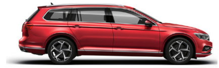
Tornado Red Solid*