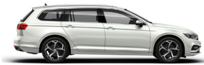
Oryx White Pearl Effect*