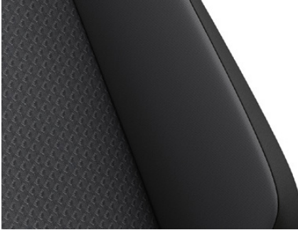
"Lizard" cloth Titan Black/Blue (TO) Standard on Passat models