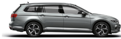
Pyrite Silver Metallic*