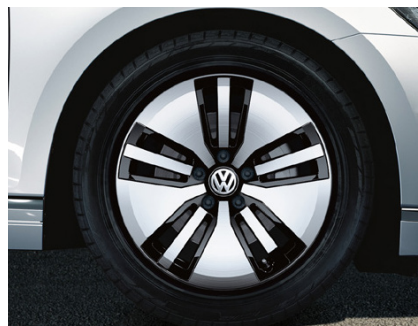
STANDARD ON GTE 17" 'Montpellier' alloy wheels 7J x 17 Tyres: 215/55 R17

The addition of optional extras may result in the vehicle increasing in Co2 g/km and therefore, attracting a higher rate of VRT than described in this product guide. For your exact configuration value, both Co2 g/km and RRP, please visit volkswagen.ie configurator.