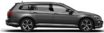
Urano Grey Solid