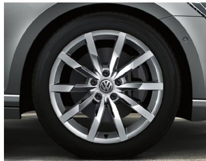
STANDARD ON R-LINE 18" 'Monterrey' alloy wheels in grey metallic 8J x 18 Tyres: 235/45 R18