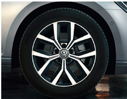
STANDARD ON ELEGANCE 17" 'Nivelles' alloy wheels 7J x 17 Tyres: 215/55 R17