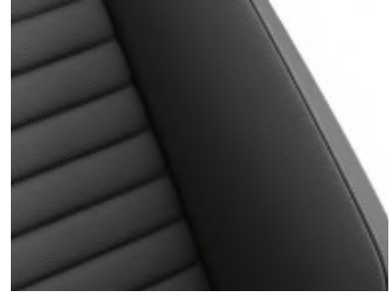
"ArtVelours"/ "Vienna" leather Titan Black/Blue (TO) Standard on Elegance/ R-Line