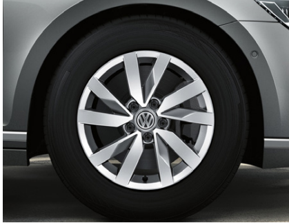
STANDARD ON PASSAT 16" 'Aragon' alloy wheels 6.5J x 16 Tyres: 215/60 R16

The addition of optional extras may result in the vehicle increasing in Co2 g/km and therefore, attracting a higher rate of VRT than described in this product guide. For your exact configuration value, both Co2 g/km and RRP, please visit volkswagen.ie configurator.