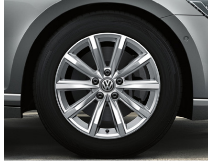
STANDARD ON BUSINESS 17" 'London' alloy wheels 7J x 17 Tyres: 215/55 R17