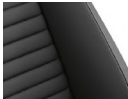
"Vienna" leather (WL1) Titan Black/Blue (TO) Optional on Business models

Note 1: Some parts of leather interior trim will contain artificial leather. Note 2: The print processes do not allow exact reproduction of the upholstery & insert colours.