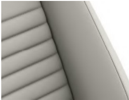
"Nappa" leather (WL7) Mistral (YR) Optional on Elegance and R-Line