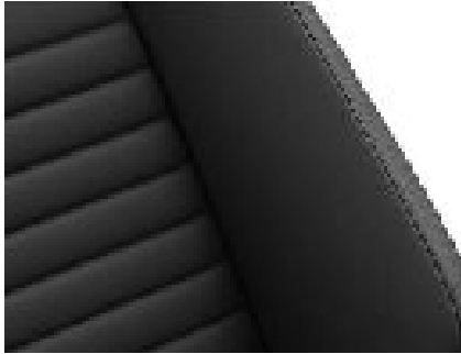
"Nappa" leather (WL7) Titan Black/Blue(TO) Optional on Elegance/ R-Line