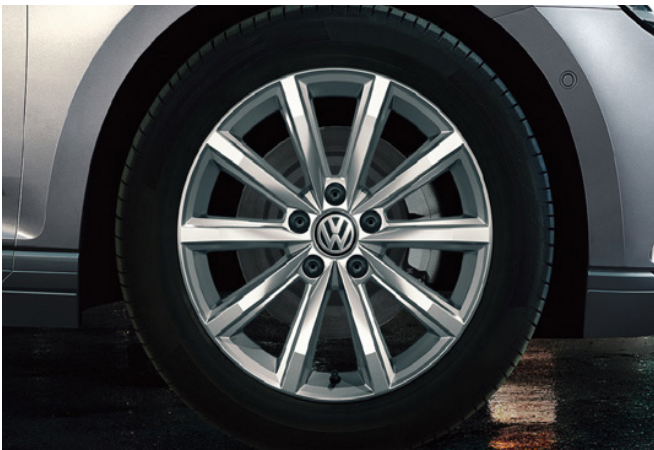
Note: The above images shows optional "Pyrite Silver" metallic paint