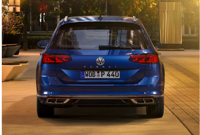
Note: The above image shows 'R-Line' Model in "Lapiz Blue" metallic paint with optional Matrix LED package.