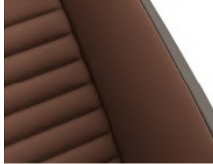
"Nappa" leather (WL7) Florence/Titan Black (DN) Optional on Elegance/ R-Line Note: Requires PDS Black Headliner