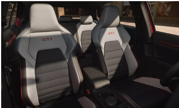
'Vienna' Leather WL3 Pack Soul- Tornado Red (UG) Option GTI