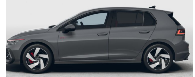
Moonstone Grey Solid*