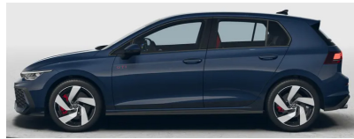
Anemore Blue Metallic *