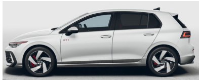
Oryx White Pearl Effect*