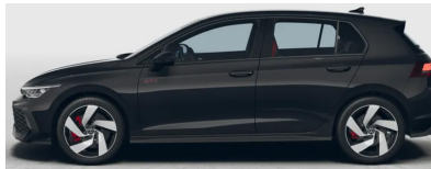
Grenadila Black Metallic*