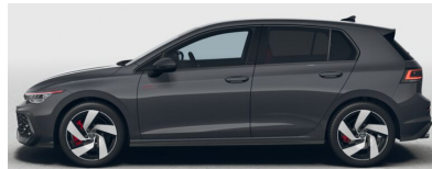
Dolphin Grey Metallic*