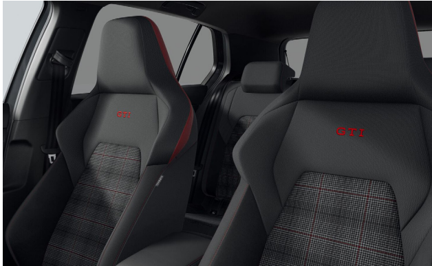
'Scale Paper' fabric Soul- Tornado Red (UG) Standard on GTI