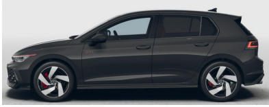
Urano Grey Solid