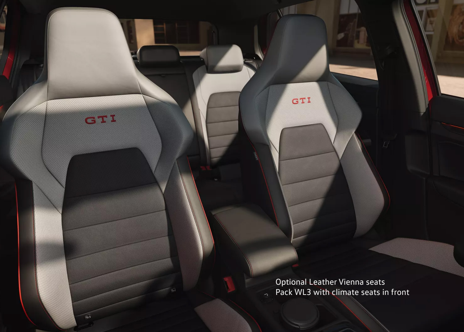
Optional Leather Vienna seats Pack WL3 with climate seats in front

You can enjoy the full view with the optional electric panoramic pop-out/sunroof. The generous glass surface offers more brightness and the passengers an unobstructed view of the sky. At the same time, its electric sun blind protects against excessive sunlight.