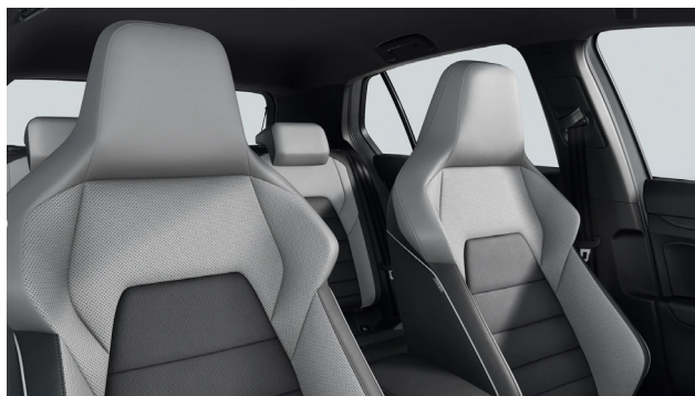
'Vienna' Leather WL3 Pack Soul-Crystal Grey (UN) Option GTE

* Optional at extra cost. Please note, the print processes do not allow exact reproduction of the upholstery colours.