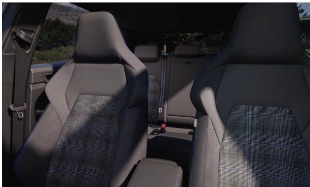
'Scale Paper' fabric Soul Black-Blue (UP) Standard on GTE