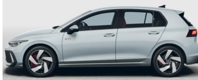
Crystal Ice Blue Metallic*