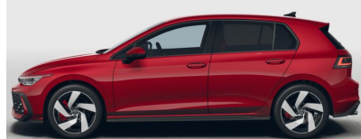
Kings Red Metallic*