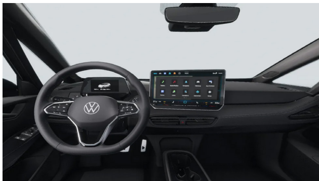
Standard on ID.3 Pure, Pro & Pro S Models Soul/ Crystal Grey stitching