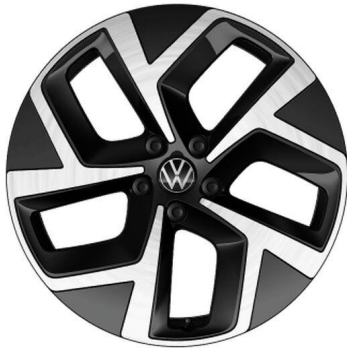
OPTIONAL ON ID.3 PRO MODELS 19" 'Wellington' alloy wheels 7.5J x 19 Tyres: 215/50 R19