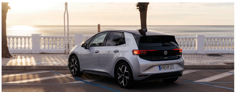
Note: The above image shows ID.3 Pro Plus with optional 19" 'Wellington' alloy wheels

The above specifications are for information purposes only as our products are continually updated and changes may be made to the specifications at any time. If you require any specific feature, you must consult your local dealer who is regularly updated with any change in specification. Specifications are subject to change without notice.