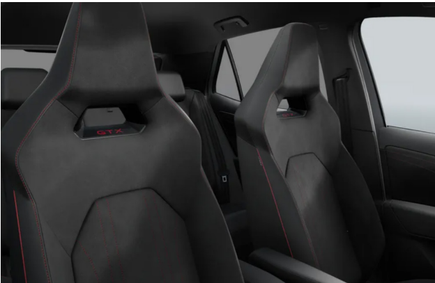
GTX Artvelour Top Sport seats