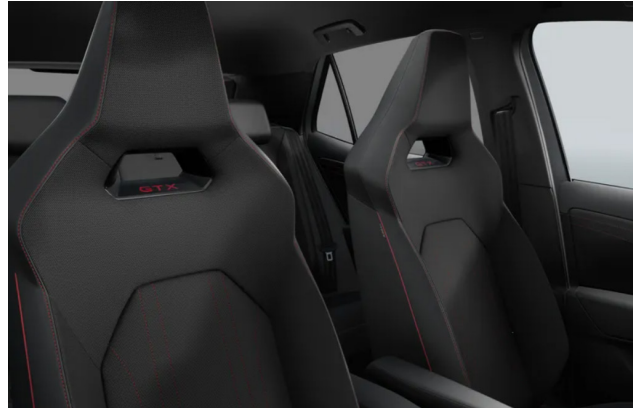
"GTX" Fabric sport seats

Standard on ID.3 Pure, Pro & Pro S Models