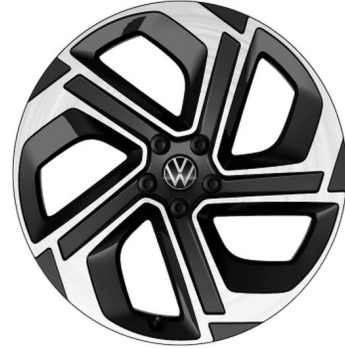
STANDARD ON ID.3 GTX MODELS 20" 'Skagen' alloy wheels 8J x 20 Tyres: 215/40 R20 8J x 20 Tyres: 235/40 R20 1