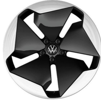
STANDARD ON ID.3 PRO S MODELS 20" 'Sanya' alloy wheels 7.5J x 20 Tyres: 215/45 R20