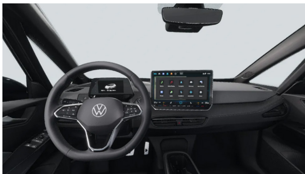
Optional on ID.3 Pro Models with Interior / Interior Package Dusty Grey Dark / Crystal Grey stitching

Note: Some parts of leather interior trim will contain artificial leather Note: The print processes do not allow exact reproduction of the upholstery & insert colours.