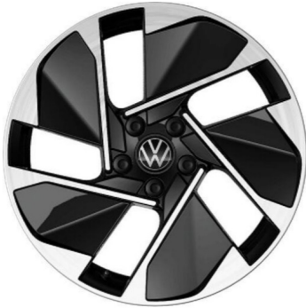
STANDARD ON ID.3 PRO PLUS 18" 'East Derry' alloy wheels 7.5J x 18 Tyres: 215/55 R18