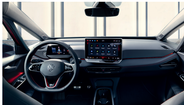
Standard on ID.3 GTX Models Soul / Red stitching