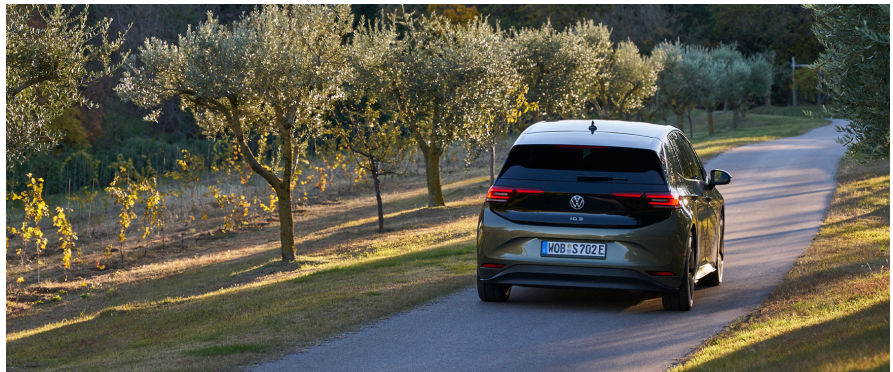
Note: The above image shows ID.3 Pro S with optional Exterior Package