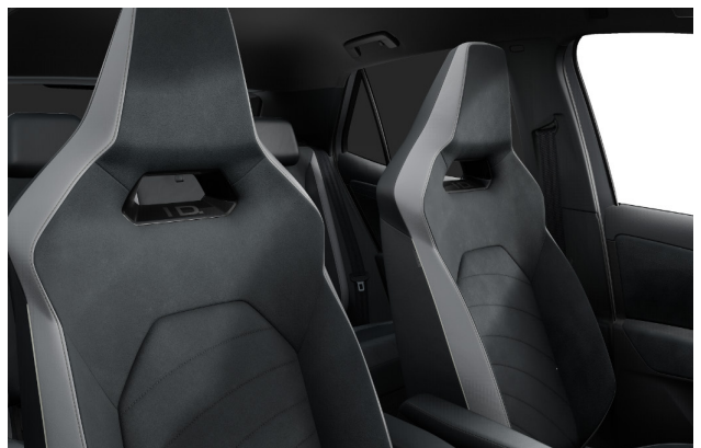
Artvelour Top Sport seats

Optional on ID.3 Pro & Pro S Models with Interior Package