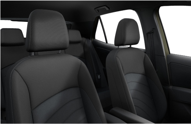
"Taia" Fabric seats