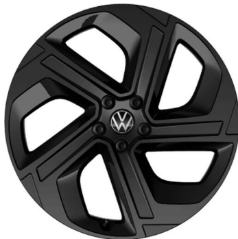
OPTIONAL ON ID.3 GTX PERFORMANCE PLUS 20" 'Skagen' alloy wheels in black 8J x 20 Tyres: 215/45 R20 8J x 20 Tyres: 235/40 R20 1