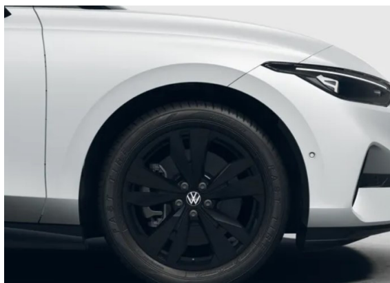
OPTIONAL ON ID.7 PRO PLUS / PRO S PLUS (WBS) 19" "Bergen" alloy wheels 8 J x 19 / 8.5 J x 19, in black