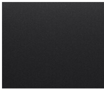
Grenadilla Black Metallic OE0E