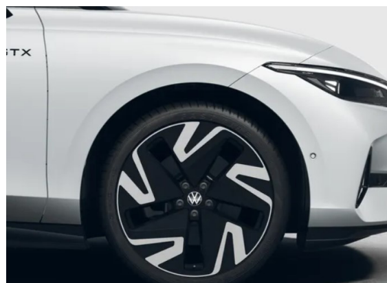
OPTIONAL ON ID.7 GTX PLUS (PJ6) 21" "Mataró" alloy wheels 8.5 J x 21 / 9.5 J x 21, in black high-sheen, Volkswagen R

For exact options prices for your vehicle, please contact your local dealer or visit www.volkswagen.ie