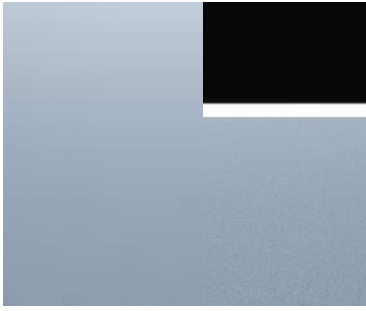
Stonewashed Blue Metallic 5Y5Y / 5YA1