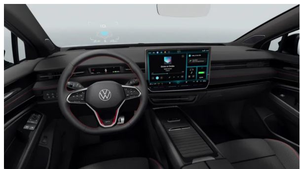
Soul Black - Red (ZQ) Standard from ID.7 GTX PLUS

Note: The print processes do not allow exact reproduction of the upholstery & insert colours.