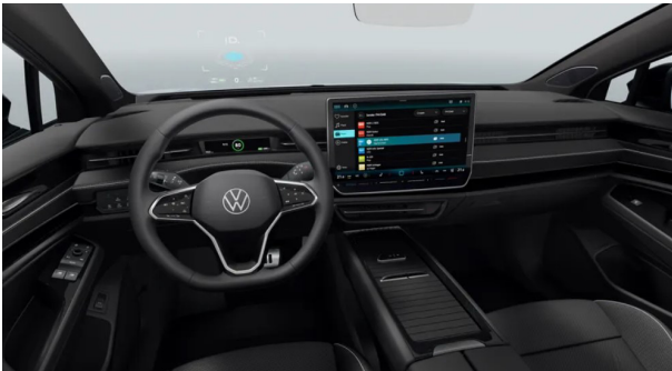
Soul Black (ZO) Optional from ID.7 PRO PLUS / PRO S PLUS (forces option package PBF)