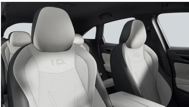
Inserts of front seats and outer rear seats in perforated ArtVelours ECO microfleece, seat bolsters in Artex Mistral / Soul Black / White Steering Wheel (AK) (forces option package PBF) Optional from ID.7 PRO PLUS / PRO S PLUS