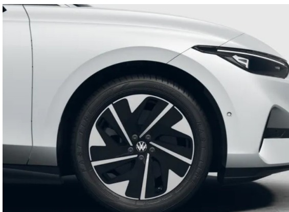
STANDARD ON ID.7 PRO PLUS / PRO S PLUS 19" "Hudson" alloy wheels 8 J x 19 / 8.5 J x 19, in black/high-sheen