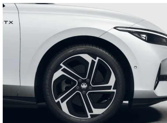
STANDARD ON ID.7 GTX PLUS 20" "Skagen" alloy wheels 8.5 J x 20 front, 9.5 J x 20 rear, in black, high-sheen surface, Airstop Tyres