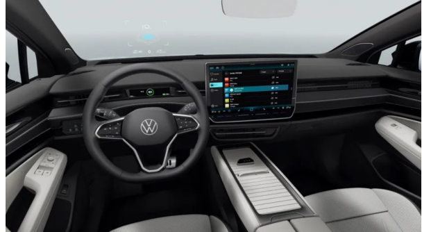
Mistral / Soul Black (ZP) Optional from ID.7 PRO PLUS / PRO S PLUS (forces option package PBF)