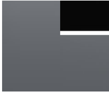
Moonstone Grey Solid C2C2 / C2A1