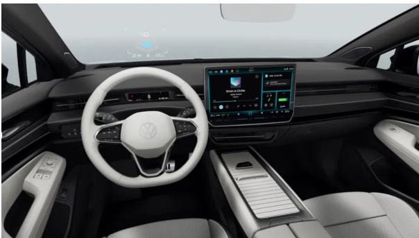
Mistral / Soul Black / Grey Detail / White Steering Wheel (AK) Optional from ID.7 PRO PLUS / PRO S PLUS (forces option package PBF)