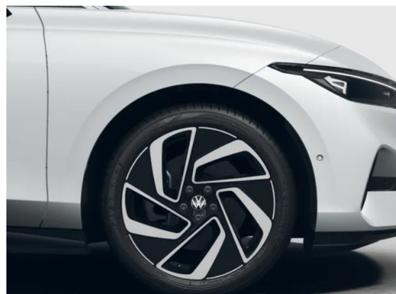
OPTIONAL ON ID.7 PRO PLUS / PRO S PLUS / GTX (PJ2) 20" "Montreal" alloy wheels 8.5 J x 20 / 9.5 J x 20, in black/high-sheen, Airstop Tyres