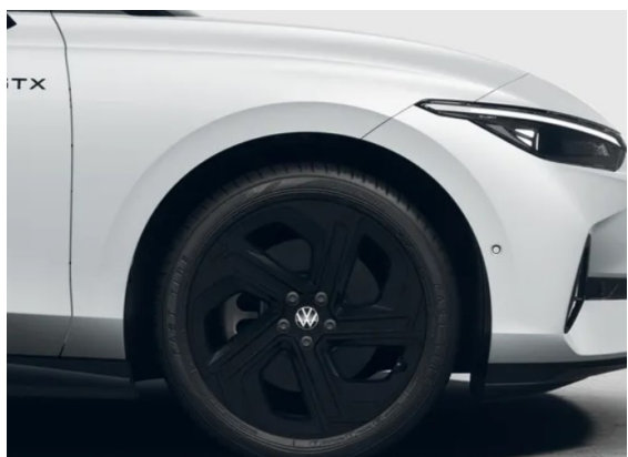
OPTIONAL ON ID.7 GTX PLUS (PJ3) 20" "Skagen" alloy wheels - Black Finish. Airstop Tyres 8.5 J x 20 front, 9.5 J x 20 rear, in black, high-sheen surface, Airstop Tyres