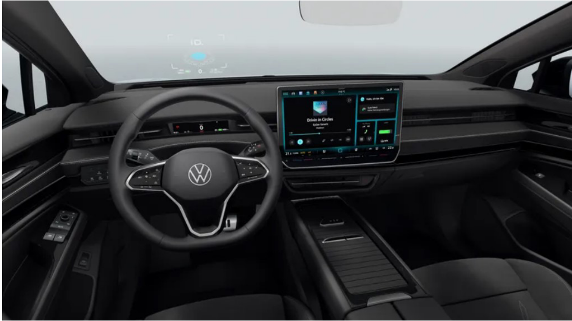
Soul Black (ZN) Standard from ID.7 PRO PLUS / PRO S PLUS