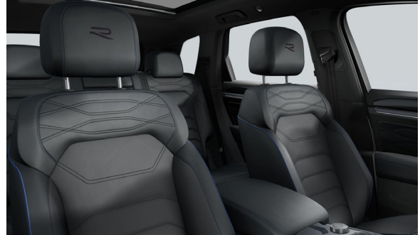
Optional "Puglia" leather Soul Black