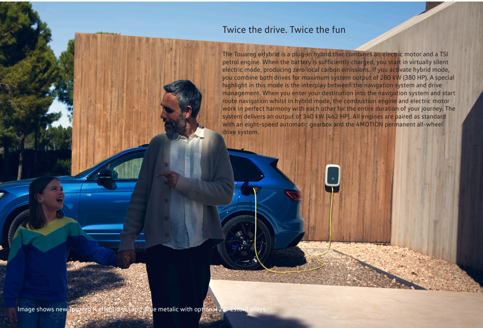
Image shows new Touareg R eHybrid in Lapiz Blue metallic with optional 22" Estoril alloys

The Touareg eHybrid is a plug-in hybrid that combines an electric motor and a TSI petrol engine. When the battery is sufficiently charged, you start in virtually silent electric mode, producing zero local carbon emissions. If you activate hybrid mode, you combine both drives for maximum system output of 280 kW (380 HP). A special highlight in this mode is the interplay between the navigation system and drive management. When you enter your destination into the navigation system and start route navigation whilst in hybrid mode, the combustion engine and electric motor work in perfect harmony with each other for the entire duration of your journey. The system delivers an output of 340 kW (462 HP). All engines are paired as standard with an eight-speed automatic gearbox and the 4MOTION permanent all-wheel drive system.