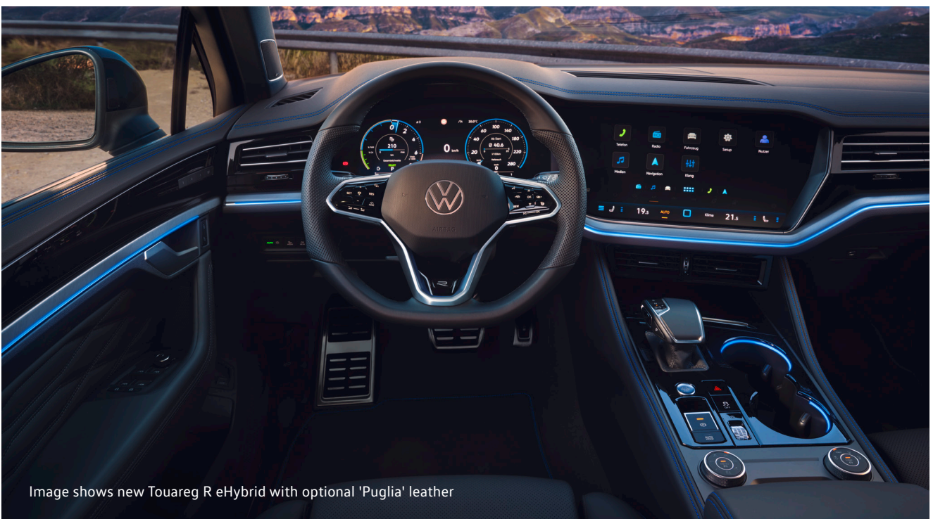
Image shows new Touareg R eHybrid with optional 'Puglia' leather