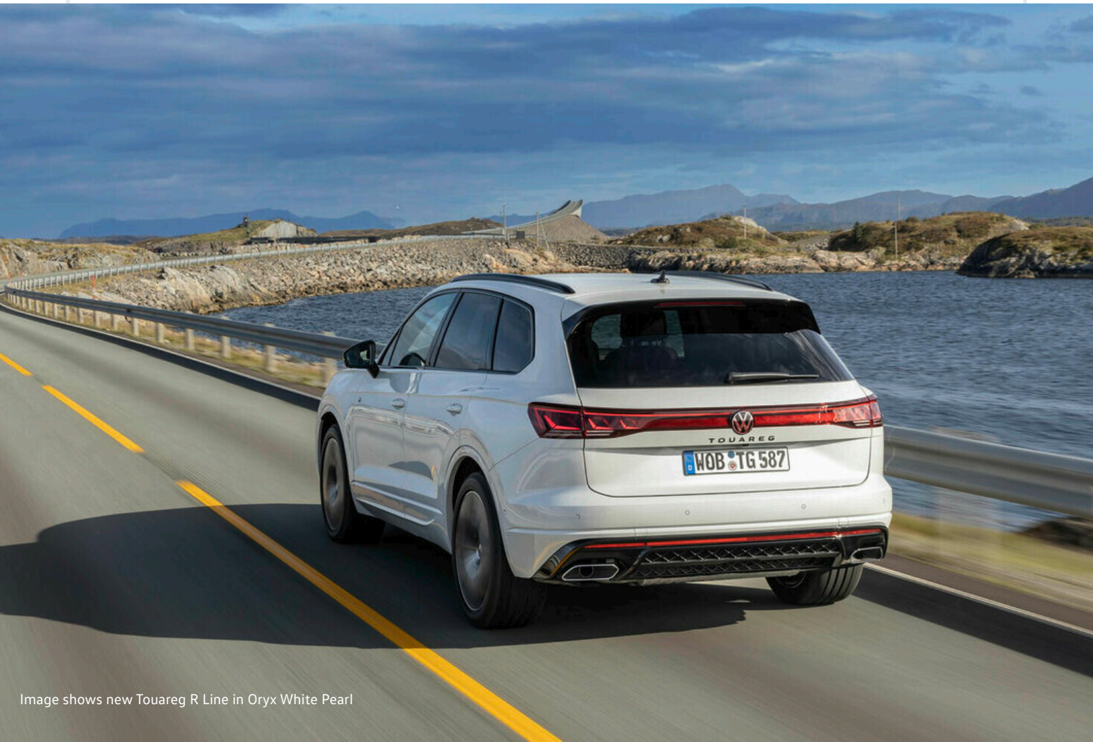
Image shows new Touareg R Line in Oryx White Pearl