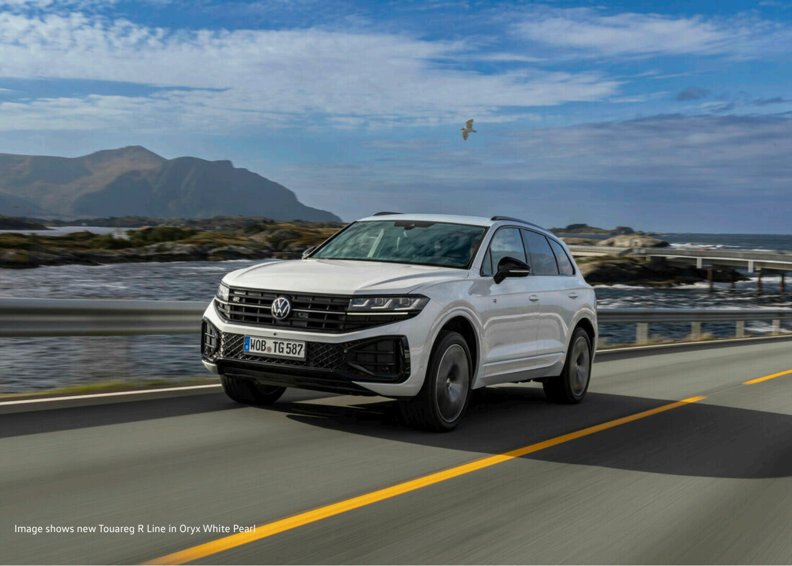
Image shows new Touareg R Line in Oryx White Pearl