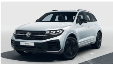
Oyster Silver Metallic