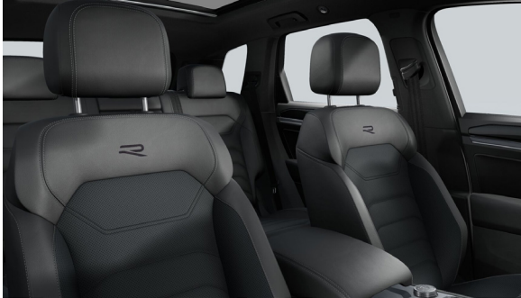
"Vienna" leather R eHybrid Soul Black - Crystal Grey