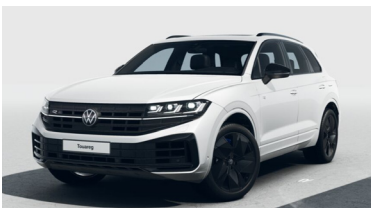
Oryx White Pearl Effect