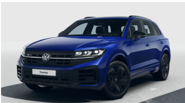
Lapiz Blue Metallic*