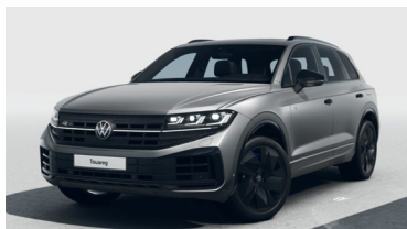
Silicon Grey Matt*