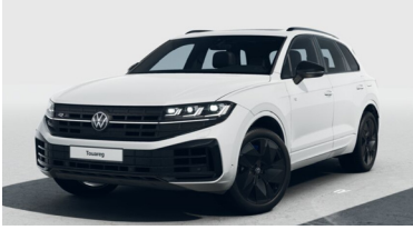
Pure White Solid